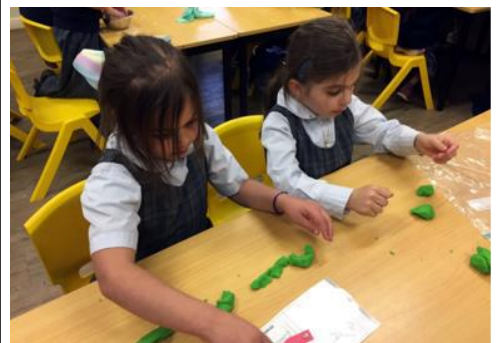
S1 GROUP STATION LEARNING